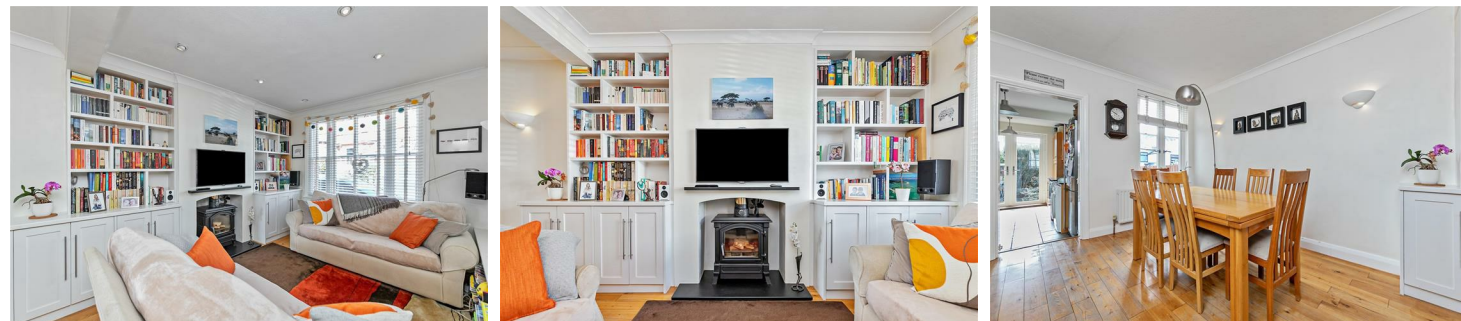
Ground Floor Approx. 465.6 sq. feet

A bright and spacious three double bedroom Victorian end terrace home set in the heart of St. Albans. This property will appeal to the busy professional, commuter or family who are looking for city centre living, good restaurants, plenty of outdoor places for leisure and socialising, excellent schools and easy access to the two stations, linking St. Albans to London in approximately 30 minutes. Accommodation is arranged over two floors with an entrance hall leading to the sitting/dining room having a log burner and oak panel floor. Off the dining room there is a spacious kitchen with integrated hob and oven, granite worktops and double glazed French doors opening to the garden. On the first floor there are three double bedrooms and well-appointed modern family bathroom. The landscaped rear garden is fully enclosed offering a high degree of privacy and has the rare benefit of sheltered side access.